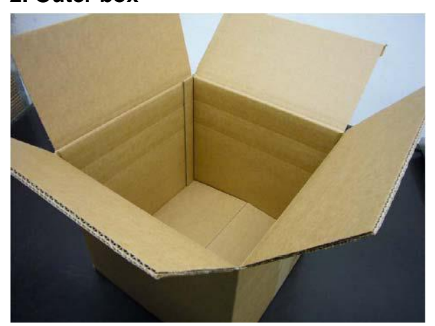
The size of the outer box depends on delivered quantity