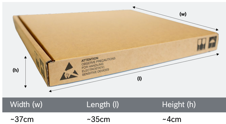
Table 1: Dimension of inner box