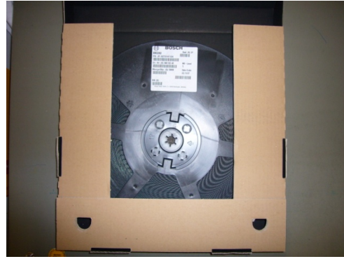
Table 1 : Dimension of inner box